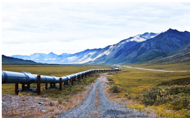
Figure 2. Pipeline monitoring covers long distances, multiple measurements and challenging environments.

self-healing, blacklisting, security, selectable device transmission intervals, etc.