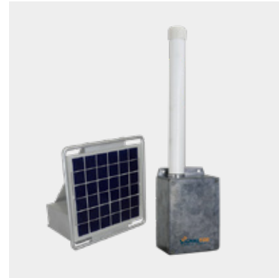
A2 with Solar panel