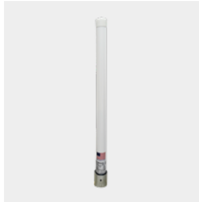
Gateway Modbus Stick